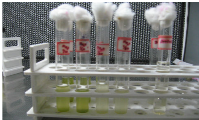
Figure. 2: MIC of the tested plant extracts.

The MIC and MBC were determined against the tested microorganism (FIG.2).