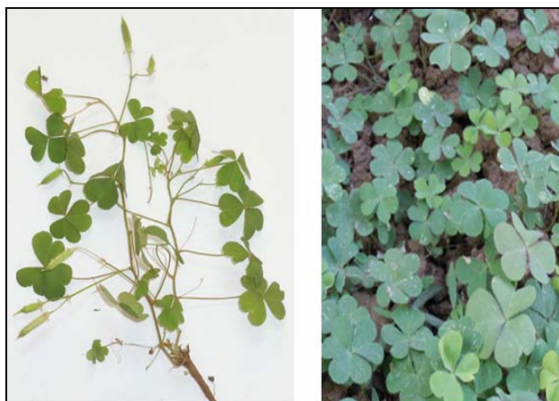
Fig.1: Image of Oxalis corniculata Linn.

Oxalis corniculata Linn. is a sub-tropical plant being native of India, are commonly known as creeping wood sorrel [6]. It is a somewhat delicate-appearing, low-growing, herbaceous plant abundantly distributed in damp shady places, roadsides, plantations, lawns, nearly all regions throughout the warmer parts of India, especially in the Himalayas up to 8,000 ft-cosmopolitan [7,8].