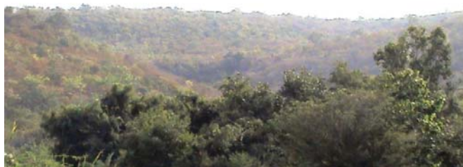
Fig 4. Yerramalai forest