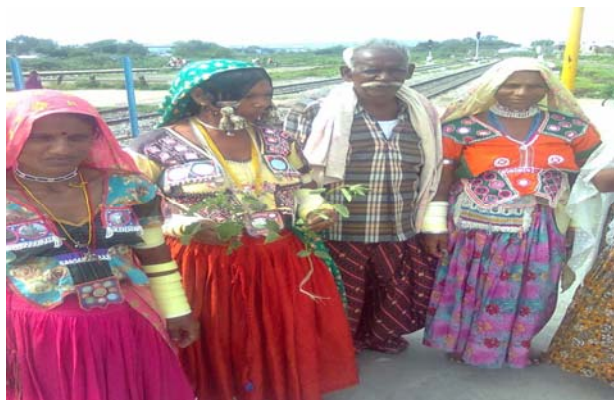
Fig 3. Tribals (Banjaras)

agriculture, pastoralism as the mainstay of their economy in Dhone. Madhavaram, Peapaly, Veldurthy, Nadyal, Bethamcherla, Banaganapalli mandlas respectively of Kurnool District of Andhra Pradesh. However, the Kurnool part of Yerramlais is relatively unexplored and little work has been done in context of ethnobotany. So the present study was undertaken on information of ethnobotanical plants used by Sugalis of Kurnool district,