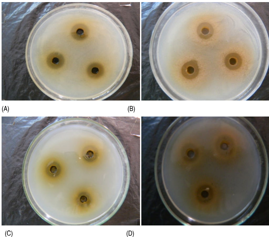
A) Acetone extract against B. megaterium C) Ethylacetate extract against S. aureus